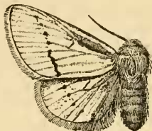
Phiala similis ♀ ½.

Frons below and at the sides, palpi, pectus, legs, and abdomen ochre-yellow. Tarsi slightly spotted with fuscous; vertex of head and collar pale yellow; upperside of thorax and wings white; wings